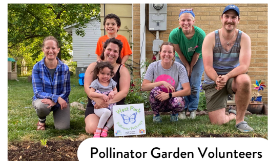
Pollinator Garden Volunteers

55 Trees Planted with Healthy Urban Tree Canopy Grant