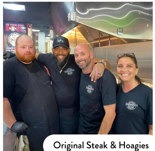
Original Steak & Hoagies

$1.5M Secured in Funding Toward the Old Lorain Connector Project