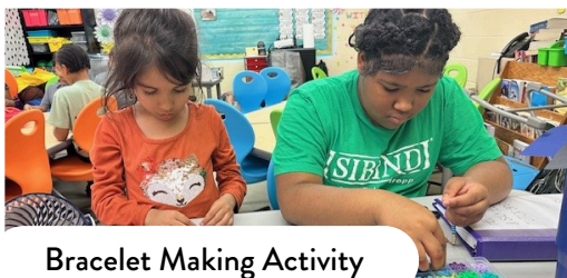
Bracelet Making Activity

60 Clare E. Westropp Students Enrolled in Program