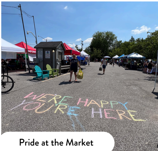
Pride at the Market