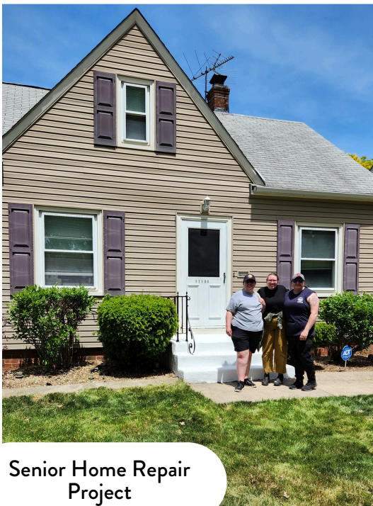
Senior Home Repair Project

23 Senior Home Repair Projects Completed Totaling $11,500